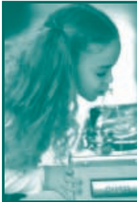
Wetlands improve water quality in rivers and streams. they are valuable filters for water that may eventually become drinking water.

Wetlands improve water quality in nearby rivers and streams, and thus have considerable value as filters for future drinking water. When water enters a wetland, it slows down and moves around wetland plants. Much of the suspended sediment drops out and settles to the wetland floor. Plant roots and microorganisms on plant stems and in the soil absorb excess nutrients in the water from fertilizers,