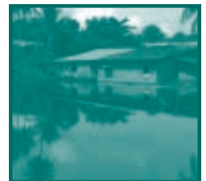
One of the most valuable benefits of wetlands is their ability to store flood waters. Maintaining only 15% of the land area of a watershed in wetlands can reduce flooding peaks by as much as 60%. (Source: The Wetlands Initiative, EPA) (See EPA843-F-06-001, "Wetlands and Flooding.")

Administration). Wetlands can play a role in reducing the frequency and intensity of floods by acting as natural buffers, soaking up and storing a significant amount of floodwater. A wetland can typically store about three-acre feet of water, or one million gallons. An acre-foot is one acre of land, about three-quarters the size of a football field, covered one foot deep in water. Three acre-feet describes the same area of land covered by three feet of water. Coastal wetlands serve as storm surge protectors when hurricanes or tropical storms come ashore. In the Gulf coast area, barrier islands, shoals, marshes, forested wetlands and other features of the coastal landscape can provide a significant and potentially sustainable buffer from wind wave action and storm surge generated by tropical storms and hurricanes. (Source: Working Group for Post-Hurricane Planning for the Louisiana Coast) After peak flood flows have passed, wetlands slowly release the stored waters, reducing property damage downstream or inland. One reason floods have become more costly is that over half of the wetlands in the United States have been drained or filled. The loss of more than 64 million acres of wetlands in the Upper Mississippi Basin since the 1780's contributed to high floodwaters during the Great Flood of 1993 that caused billions of dollars in damage. (Source: "Flood Damage Reduction in the Upper Mississippi River Basin—An Ecological